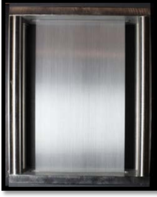
FIG. S2: Picture of the 20% nylon rod crystal and support structure.

distinct band gap between the first and second branches, for which the symbols in this simulation overlap at the Brillouin zone boundary. Of greater relevance in the context of this work is the following: while it might be tempting to try to interpret the experimental data starting from this band structure diagram, it is clear that it cannot explain the complex behavior observed near 1 MHz, and in particular why switching occurs as the number of layers in the crystal is varied or as the temperature is varied. Hence, a more detailed analysis appropriate to crystals of a finite thickness is needed, as described in the main text of the letter.