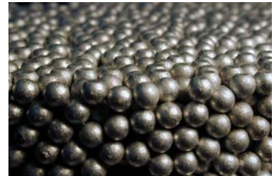
FIG 1: Side view of one of the brazen aluminum bead samples used in the ultrasound localization experiments.

Fifty years after Anderson's classic paper, in which he first proposed that electrons could become localized in the presence of disorder (thus turning a metal into an insulator), there is currently a resurgence of interest in this phenomenon for both quantum particles and classical waves [1]. This interest stems from curiosity in understanding how wave interference alone can cause the breakdown of wave transport in disordered materials, leading to a transition from extended (propagating) to localized ("frozen") waves. While the basic ideas are common to many domains of physics (quantum electronics, optics, acoustics, seismic waves and even matter waves in cold atomic gasses), our focus is in ultrasonics, where recent experiments performed at the University of Manitoba have provided the most convincing demonstration ever that this elusive effect can indeed be observed for classical waves in three dimensions [2].